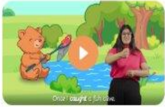
1, 2, 3, 4, 5, Once I Caught a Fish Alive