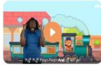
Down at the Station