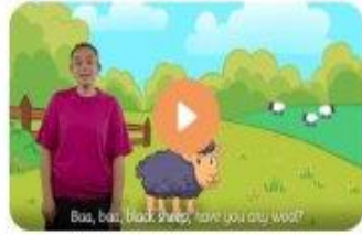
Baa, Baa, Black Sheep