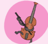
Hey, Diddle, Diddle