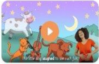
Hey, Diddle, Diddle