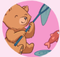
1, 2, 3, 4, 5, Once I Caught a Fish Alive