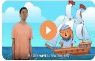
A Sailor Went to Sea