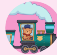
Down at the Station