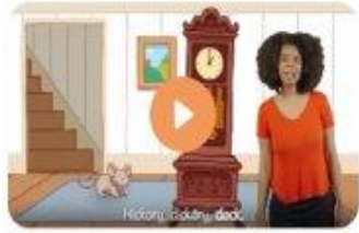
Hickory, Dickory, Dock