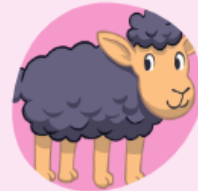
Baa, Baa, Black Sheep