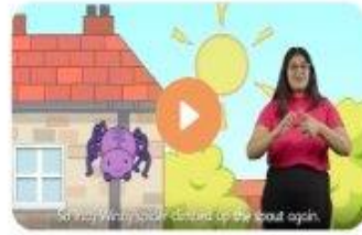
Incy Wincy Spider