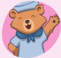
A Sailor Went to Sea